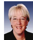
Sen. Patty Murray (D-WA)