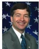
Rep. Jeb Hensarling (R-TX)