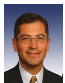
Rep. Xavier Becerra (D-CA)