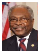
Rep. Jim Clyburn (D-SC)