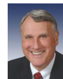
Sen. Jon Kyl (R-AZ)