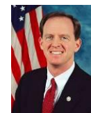
Sen. Pat Toomey (R-PA)