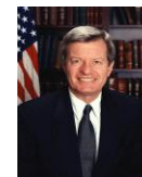
Sen. Max Baucus (D-MT)