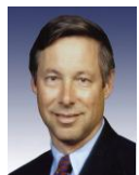
Rep. Fred Upton (R-MI)