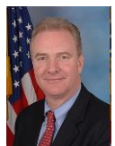
Rep. Chris Van Hollen (D-MD)