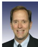
Rep. Dave Camp (R-MI)