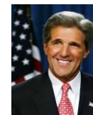
Sen. John Kerry (D-MA)