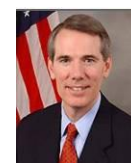
Sen. Rob Portman (R-OH)